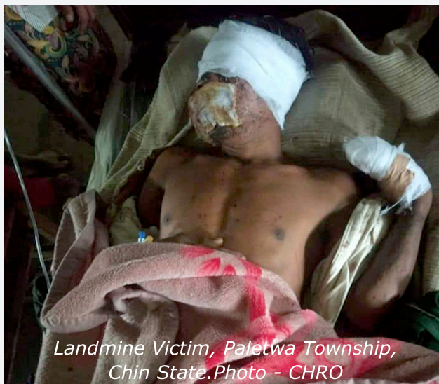
Landmine Victim, Paletwa Township, Chin State.

A 28-year-old woman was killed, and an 18-year-old woman injured after stepping on a landmine near K--- area, a 30-minute walk away from Q--- village. They were found by five women who were looking for wood, bamboo, flowers, and other natural goods. The 28-year-old left behind a 5-year-old