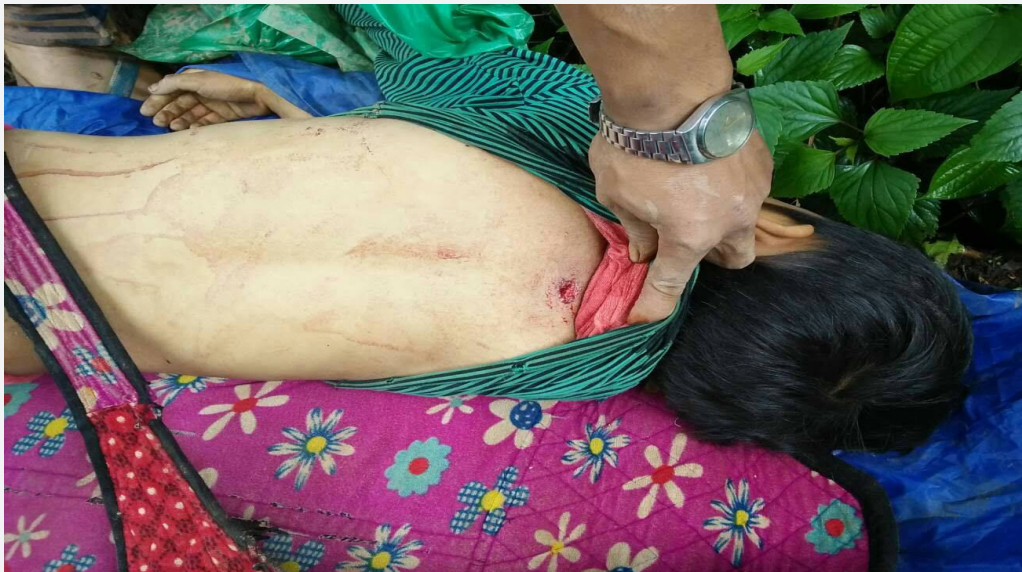
Child killed by Burma Army artillery in Kutkai Township, Northern Shan State.

On the morning of 28 June, Burma Army LID 88 shelled TNLA soldiers stationed near M--- village, Kutkai Township, Muse District, northern Shan State. According to one villager, “Burma troops started shelling from above the monastery, hitting the houses. Burmese troops brought cars and motorcycles to send injured villagers to Kutkai hospital. Villagers received serious injuries and were very scared.”