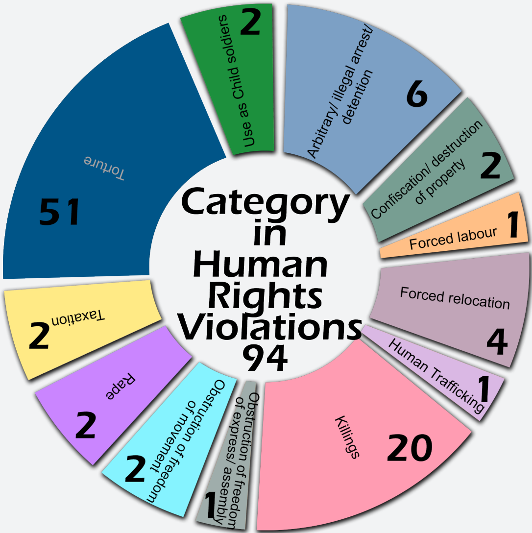
Appendix 1: ND-Burma Documented Human Rights Violations from January–December 2018