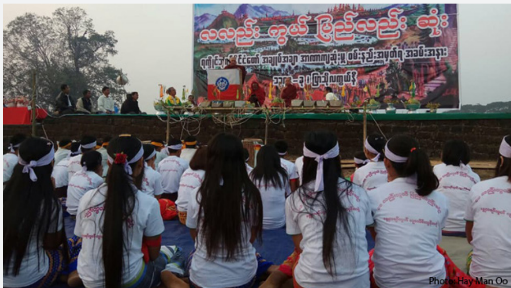
Annual event commemorating the fall of the Arakan Kingdom, January 16, 2018.

In October, two editors and a journalist from Eleven Media Group were arrested and held at Insein Prison after the Rangoon government filed a suit accusing them of reporting incorrect information regarding the city's budgeting and spending of public funds. 25 Despite an order from the President's Office for the Rangoon city government to comply with the Media Law requiring them to attempt to settle disputes outside of the court system first, the city government declined to drop the case, demanding a published apology by Eleven Media Group in government newspapers.