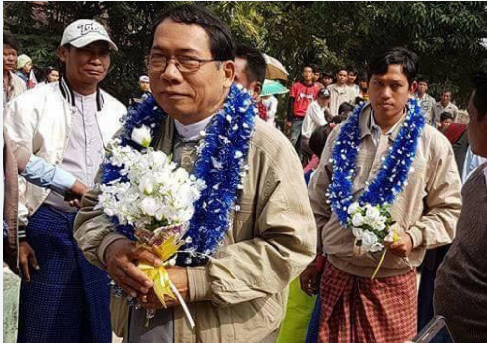
Member of parliament in the lower house (People's Parliament) Dr. Aye Maung.

Township held on 15 January 2018. He allegedly told the public in his speech to take advantage while the Burmese government was politically weak and to struggle towards the achievement of Arakanese sovereignty.