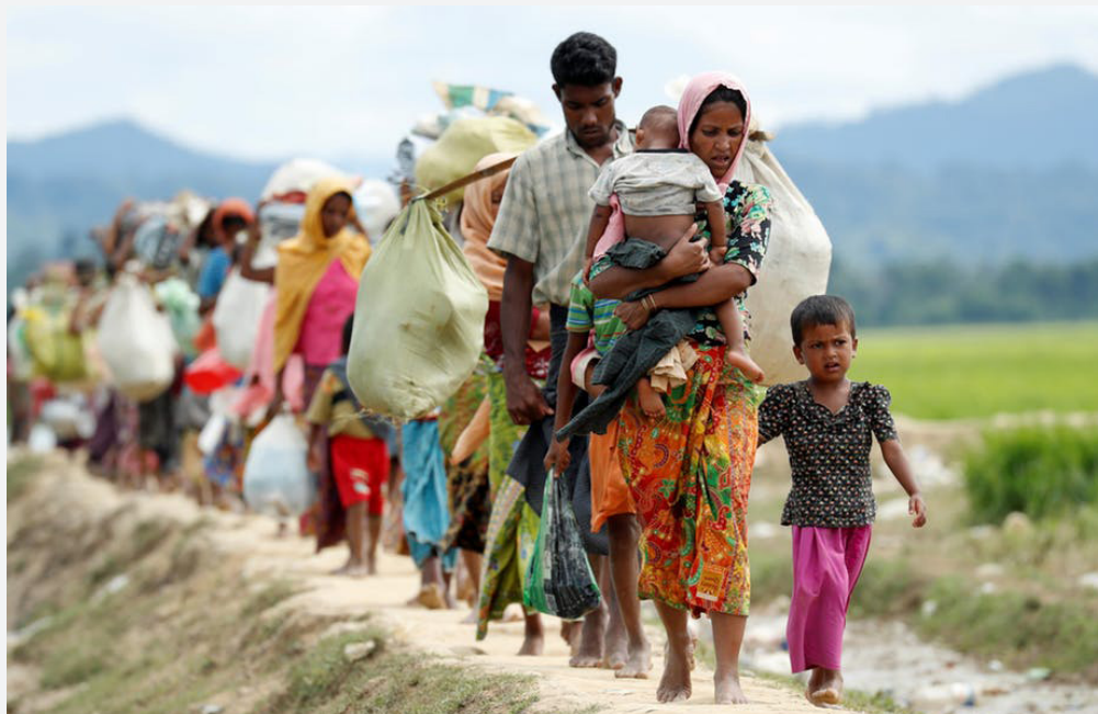
Muslim refugees walk from Myanmar to refugee camps in Bangladesh.

directly to the sanctions but allowed one of the sanctioned generals to resign, while another was dismissed for apparently unrelated reasons.